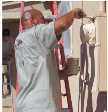
More PTT beautification & painting going on